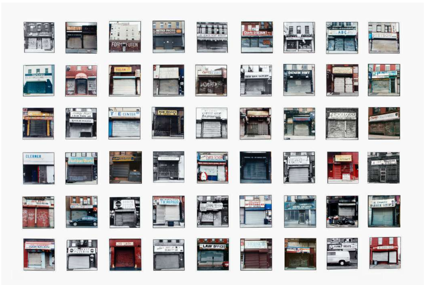
Zoe Leonard, Analogue, 1998-2009 (detail), 412 C-prints and gelatin silver prints, 28 x 28 cm (each).

Zoe Leonard (b. 1961) is an American artist working with photography, sculpture, and site-specific installation. Leonard has exhibited widely since the early 1990s. A retrospective exhibition was presented by the Whitney Museum of American Art, New York and Museum of Contemporary Art, Los Angeles in 2018. Selected solo shows include the Musée d'Art Moderne de Paris (2022); Museum of Contemporary Art, Sydney (2023); Museum of Modern Art, New York (2015); Chinati Foundation, Marfa, Texas (2013); Camden Arts Center, London (2012); Dia Art Foundation, New York (2008); Museo Reina Sofia, Madrid (2008); Kunsthalle Basel, Basel (1997); and Vienna Secession, Vienna (1997). Leonard has participated in international group shows such as the 57 th Carnegie International (2018), Documenta 9 (1992), Documenta 12 (2007), and the Whitney Biennial in 1993, 1997 and 2014. Her work can be found in major public collections internationally. She has received awards such as the Guggenheim Fellowship (2020); the Graham Foundation Grant (2020); the Bucksbaum Award (2014); and an Anonymous Was A Woman Award (2005).