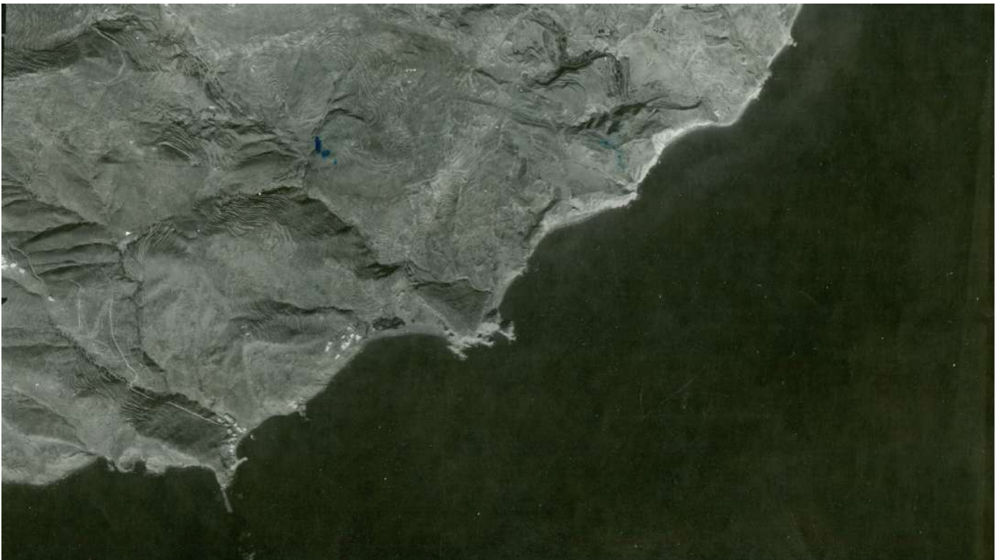
Aerial view of the port of Anafi, National Geographic Service, 1979.